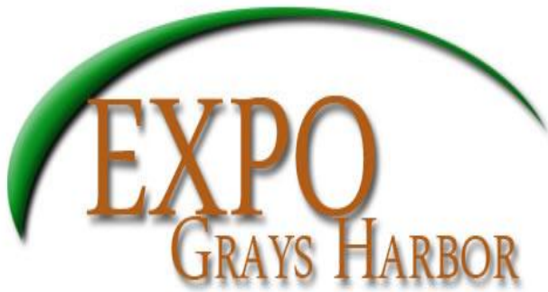
EXHIBIT SPACE RESERVATION and CONTRACT

Grays Harbor Chamber of Commerce EXPO & BITE OF GRAYS HARBOR Saturday, March 20, 2010 Aberdeen Weatherwax High School Gyms & Commons